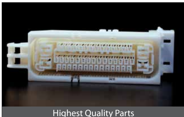
Highest Quality Parts