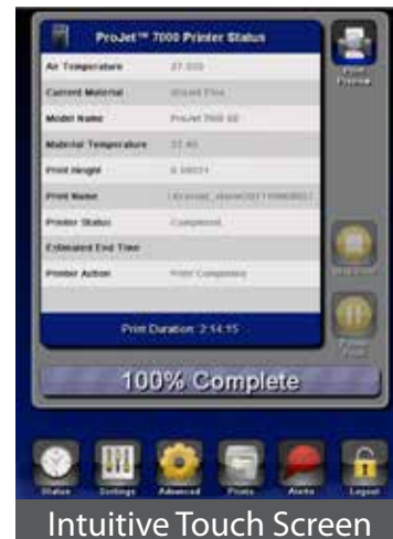
Intuitive Touch Screen

The ProJet® crossover printers come in two different sizes, three high definition print configurations and with a wide range of VisiJet® SL print materials including tough, flexible, black, clear, high temperature, high impact, dental and jewelry.