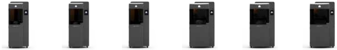
ProJet® 6000 SD ProJet® 6000 HD ProJet® 6000 MP ProJet® 7000 SD ProJet® 7000 HD ProJet® 7000 MP

Extend Innovation. Extend Production. Extend Choices.